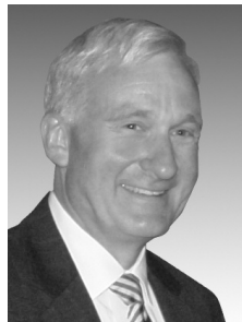
Rhode Island Supreme Court Chief Justice Paul A. Suttell